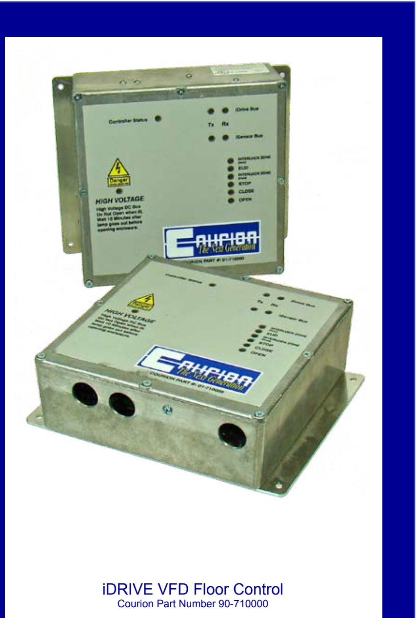
iDRIVE VFD Floor Control Courion Part Number 90-710000

EASY TO INSTALL - The iDRIVE VFD Floor Control mounts directly to your hoistway wiring trough. Simply attach the COURION Serial CANbus Communication Cable to the iDRIVE and you are ready to go.